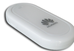
Mobile Data Modem